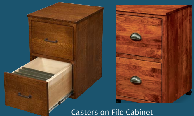
Casters on File Cabinet