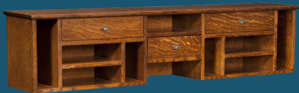
3 Drawer Organizer