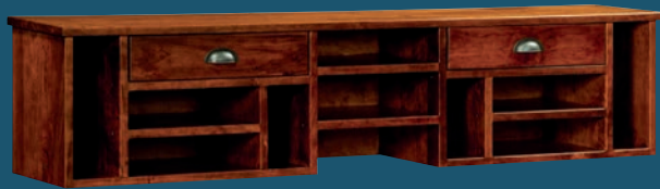
2 Drawer Organizer